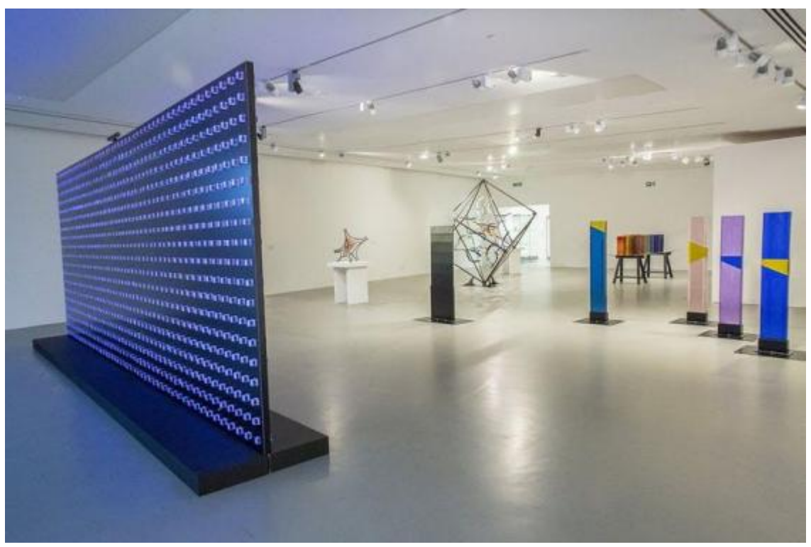
The Illuminating Colour exhibition at the National Glass Centre, Sunderland, charts our understanding of colour (Rosie Reed Gold)

In one work he gave a physical analogy – that of glass: "When the sun's light is added to an existing colour in the medium through which it passes, for example to the colour of the glass, it will necessarily incorporate itself to that colour, and draws the colour with itself, and the colour becomes the nature of the light, and the light in the nature of the colour; it will be a ray of yellow or green or red, according to the colour that it passed through."